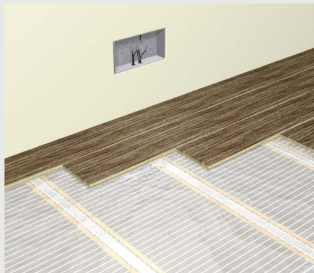
COVER ENTIRE SYSTEM WITH VAPOUR BARRIER (STOCK NO. 5415) AND LAY LAMINATE OR ENGINEERED FLOOR IN THE NORMAL WAY