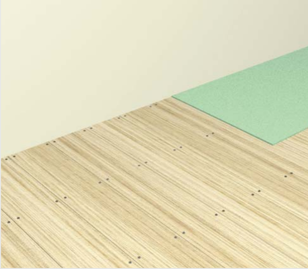
LAY INSULATION BOARD (STOCK NO. 5400) OVER ENTIRE SUBFLOOR (TIMBER OR SCREED)